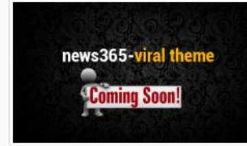
News365 Viral Theme

Activate Windows Go to Settings to activate Windows.