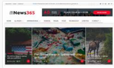
News365 Classic Theme