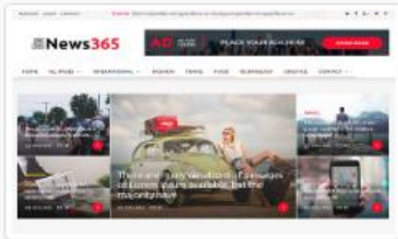
News365 Modern Theme