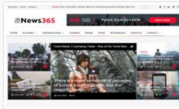
News365 Video Theme